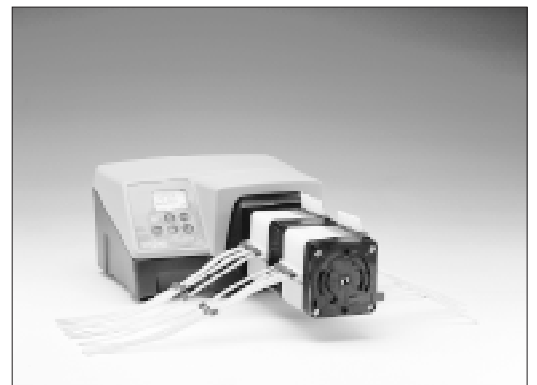
323S/MC8 + 318MCX