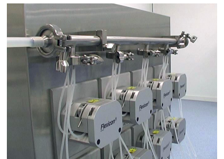
Accusil is available on reels/spools for a more efficient and cost saving set-up on filling lines with multiple pump heads