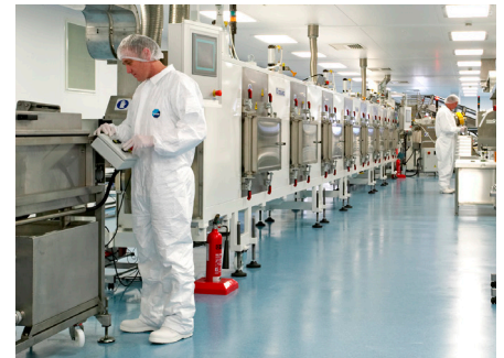
Our fully validated production facility provides a unique product quality