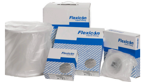
Packed for protection against contamination and UV light