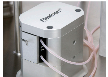
Mechanical properties of Accusil™ are adapted for use on PD12 and PF6 peristaltic pump heads