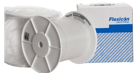
Available in 10 meter lengths or on spools in up to 150 meters