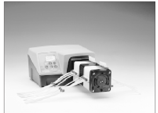
323S/MC4 + 314MCX