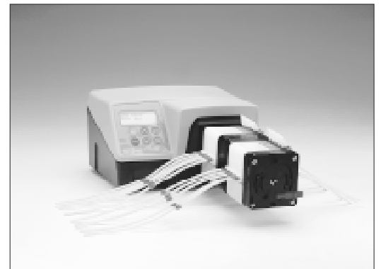
323Du/MC4 + 314MCX